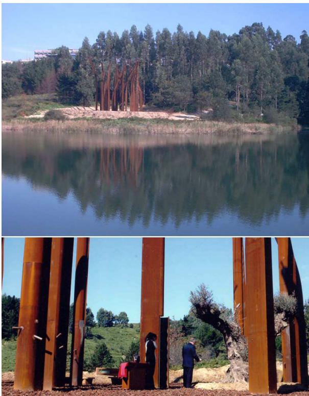
Fig. 3. “The Forest of Life” ( Vitae Silva ) in the University of the Basque Country (UPV/EHU) campus at Leioa, near Bilbao (Spain). When you arrive to Bilbao by airplane you are able to see this monument in the University campus on top of the hill. During a ceremony, the urns are deposited in the reserved space within the wooden pillars that form the Forest of Life.

How can donors be thanked? There are many different ways in which appreciation can be expressed to donors and their families, depending on local traditions, how the donation programs have evolved over the years or on religion and customs to celebrate death. In many European countries such ceremonies have already existed for a long time. The most common sign of appreciation is a thank-you letter to the families. Another possibility is a commemoration ceremony; this may be combined with the presence of medical students. For example, in Basel (Switzerland), medical students have formed a choir and they sing for the families during a ceremony where thanks are expressed for donations. At The University of the Basque Coun-