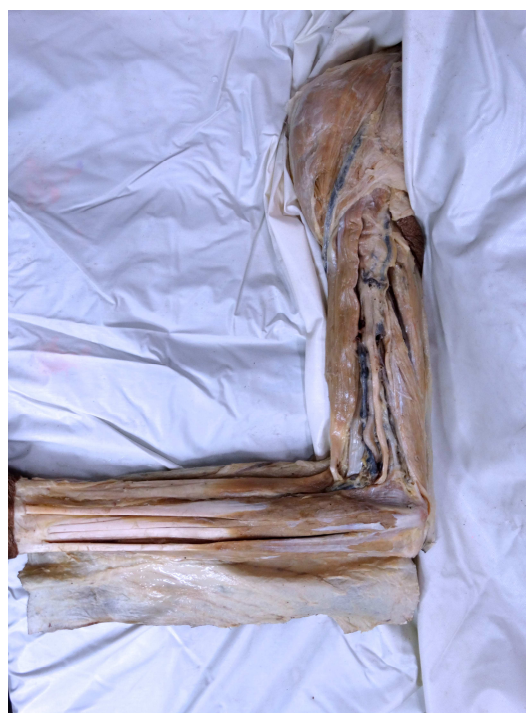
Fig. 1. Dissected specimen of superior extremity of a cadaver preserved in 1% Phenoxetol for more than six months showing the colors of muscle, nerves and vessels.

For dissection purposes we found the preservation in 1% Phenoxetol very satisfactory. Much of the rigidity of the tissues caused by the initial aldehyde fixation disappears after some weeks in Phenoxetol and all tissues gain a flexible, partly elastic, consistency not unlike the consistency of fresh unfixed tissue, and well suited for dissection and demonstration purposes, especially for demonstra-