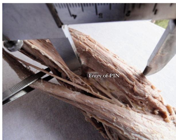
Fig. 1. Measurement of distance from the lateral epicondyle (LE) of humerus to the entry point of posterior interosseous nerve (PIN) into the supinator muscle.