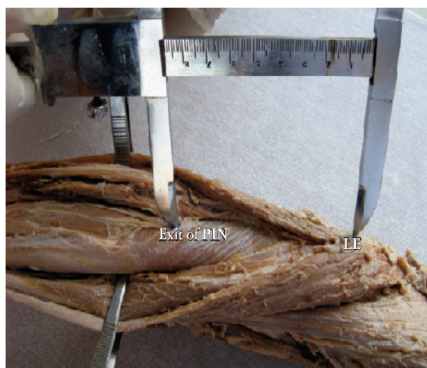
Fig. 2. Measurement of distance from the lateral epicondyle (LE) of humerus to the exit point of posterior interosseous nerve (PIN) from the supinator muscle.