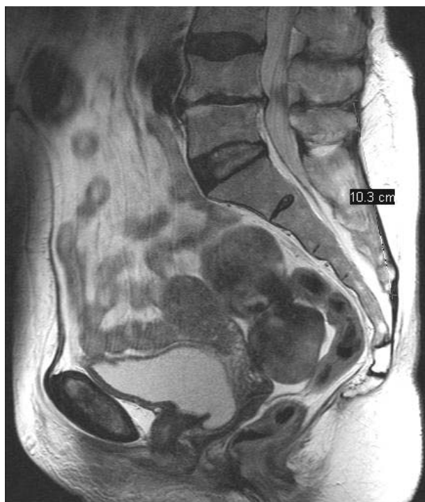
Fig. 2. Sagittal section of a pelvic magnetic resonance scan. The distance from the sacral hiatus to the fourth lumbar spinous process is measured at 10.3 cm.