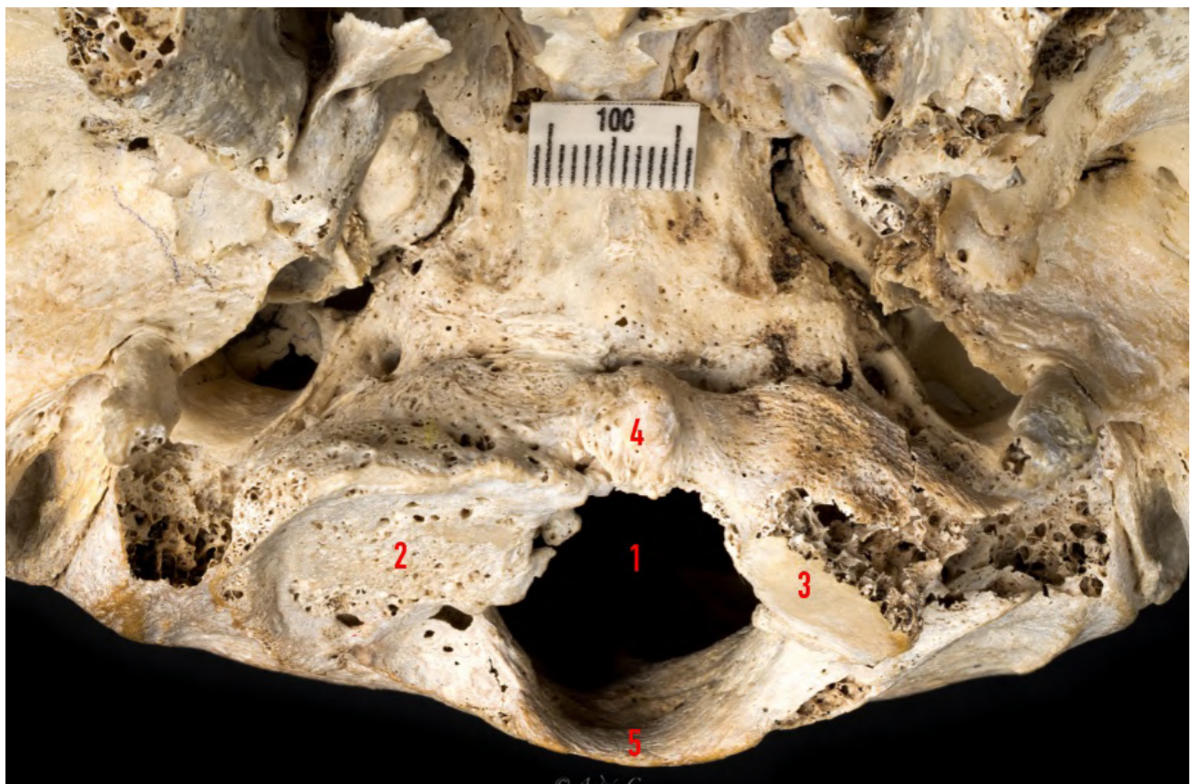
Fig. 2.- Image shows a cranium with total atlas occipitalization, seen from an anteroinferior exocranial perspective. (1: Foramen magnum, 2: Lower right articular surface of the atlas, 3: Lower left articular surface of the atlas, 4: Anterior tuber, 5: Posterior arch of the atlas).

The lateral masses for C1 are totally fused to the occipital condyles (Fig. 3). The left lateral mass presents erosion due to taphonomic effects, with a lower articular surface that is flat, smooth, and ovoid, with an antero-medial orientation and a length of 17 mm. Its latero-medial diameter could not be measured due to erosion. The right lateral mass has a lower facet joint which is irregularly circular and severely deformed by an advanced osteoarthritic process, notably increased in all its dimensions, with an antero-posterior diameter of 32 mm and a width of 29.5 mm, presenting notable lateral lipping. There are also various pores, both coalescent and punctual, of an erosive nature in the subchondral bone, accompanied by some areas with eburnation. Bone prominences appear