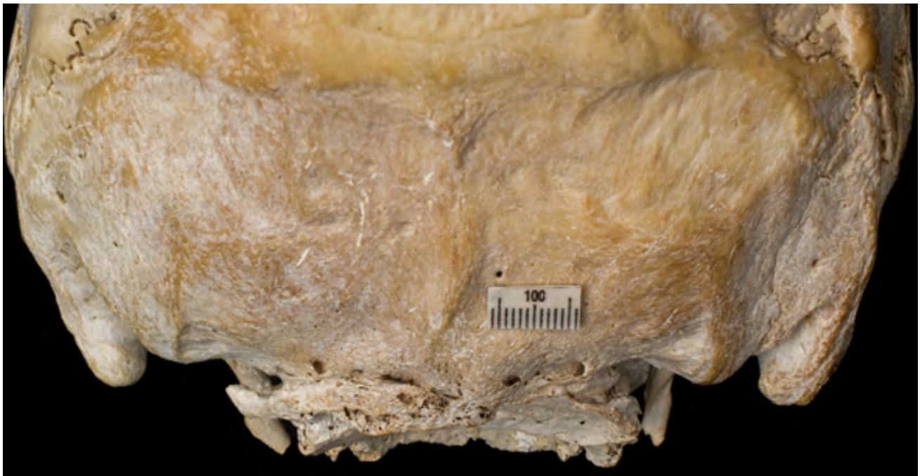
Fig. 3.- Posterior vision of total atlantooccipital fusion. Note the foramens for posterior cervical nerves to pass through.