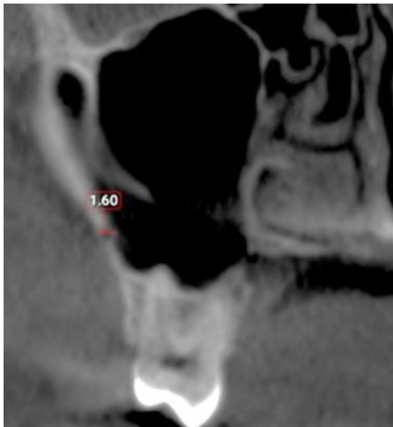
Fig. 3.- Diameter of PSAA on coronal section.