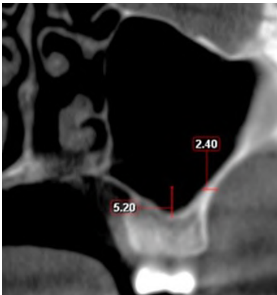
Fig. 1.- Measurement of maxillary sinus lateral wall thickness on coronal section.

The data was generated on MS Office Excel Sheet (version 2019), and statistical analysis was performed using the Statistical Package for Social Sciences (SPSS). A comparison was made between gender, dental status, and age groups. The obtained data were then subjected to descriptive statistics, One-way Anova and Independent sample t-test to analyze the statistical significant difference between the means in groups.