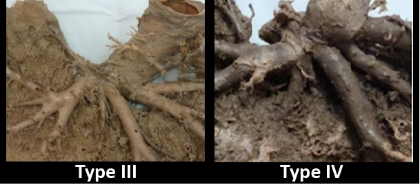
Fig 4. Types of the Common Trunk for the Middle and Left Hepatic Veins. Type I is a common trunk not receiving any branch in its last centimeter. Type II consists of a common trunk with 2 branches less than 1 cm from the IVC. Type III consists of a common trunk less than 1 cm, with 3 branches. Type IV includes a common trunk less than 1 cm, with 4 branches.

examined, 18 (90.00%) cases had a common LHV and MHV. The drainage of hepatic veins is shown in Table 3.