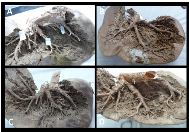
Fig 2. Variations of Middle Hepatic Vein. (A) drainage for III, IV, V segments; (B) drainage for IV, V, VI segments; (C) drainage for IV, V, VIII segments; (D) drainage for VIII segment.