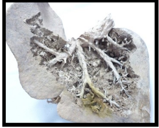
Fig 5. Accessory Branches of Hepatic Veins. This image shows a sample specimen of the right hepatic vein with two accessory branches.

using isolated clamping of the common trunk or lateral clamping of the IVC, thus maintaining partial caval flow.