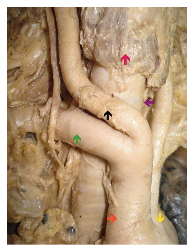
Fig. 1. Yellow arrow - arch of aorta; Orange arrow - vertically disposed high riding brachiocephalic trunk; Green arrow - right subclavian artery; Black arrow - right common carotid artery; Red arrow - thyroid isthmus; Purple arrow - left accessory inferior thyroid artery.