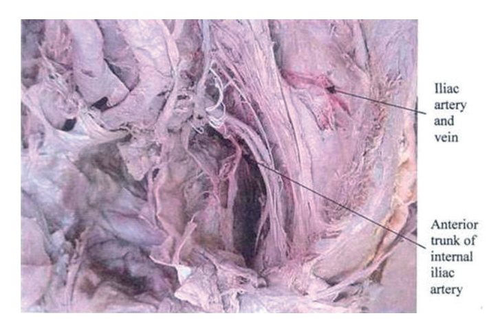
Figure 3. The branches of the internal iliac artery